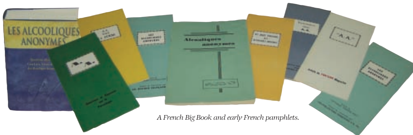
A French Big Book and early French pamphlets.